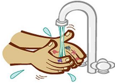
wet your hands with running water