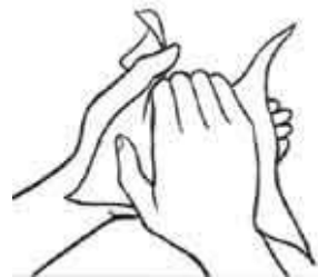
use a paper towel to dry hands & turn off the tap