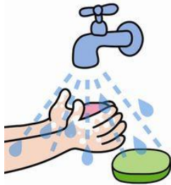
Rinse your hands thoroughly to remove all soap and germs