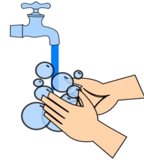
wash your hands all over, being sure to clean in between fingers, under fingernails, around wrists and both the palms and backs of hands