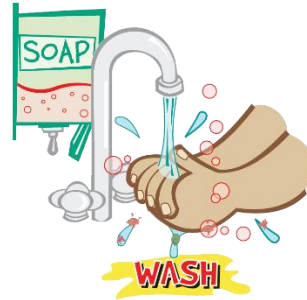
cover your hands with soap and rub your hands vigorously